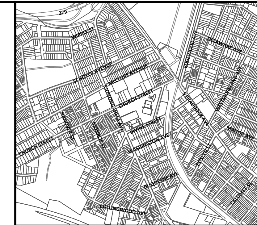
LOCATION MAP N.T.S.

Lot 2 Rocton Plan of Lots FBV 213 pg 138